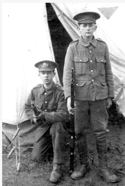
Image of young soldiers of the Lancaster Regiment